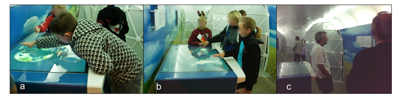
Figure 5. Observations in the train: (a) - (b) Visitors interacting with the table. (c) One person ignores the interactive table, watching the world population clock instead.

Further expansion of the GeoLens concept seems possible. While we enable more fine-grained control of the visualization in this particular application, further use cases as well as usability studies in a controlled environment would allow statements regarding the general feasibility of the approach. The combination of GeoLenses with zooming lenses is another promising research direction. Also, the current solution simply prevents lenses from overlapping; the ability to merge lenses could aid cooperation.