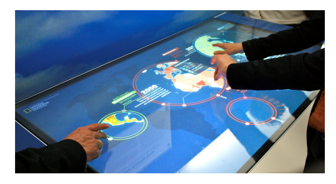
Figure 1. Users simultaneously interacting with the GlobalData application on our multi-touch table.

Antonio Krüger DFKI GmbH Saarbrücken, Germany krueger@dfki.de