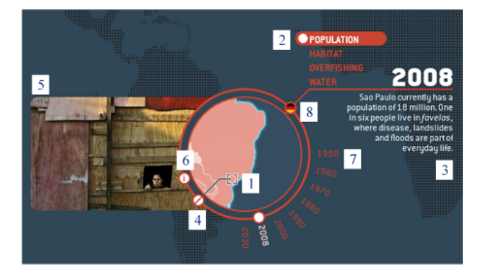
Figure 3. Screenshot of GeoLens showing the user interface components: (1) Geolocated point of interest; (2) Map view menu; (3) Geolocated text; (4) Open/close button for geolocated images and videos; (5) Geolocated image; (6) Open/close button for map legend; (7) Time slider for population data; (8) Language toggle.

person interacting with it. Dragging and resizing operations allow collective ownership and ownership transfer. All additional content and user interface elements specific to a lens are grouped around it. The area inside the lens is intentionally kept clear of user interface elements and contains map data and location markers for georeferenced items. The goal was to keep the lens itself visually clean and avoid user interface conflicts between the elements and dragging or sizing operations.